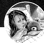
Colds and viruses